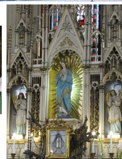
The Altar of the Mariaremete Sanctuary (Refuge of Mary)