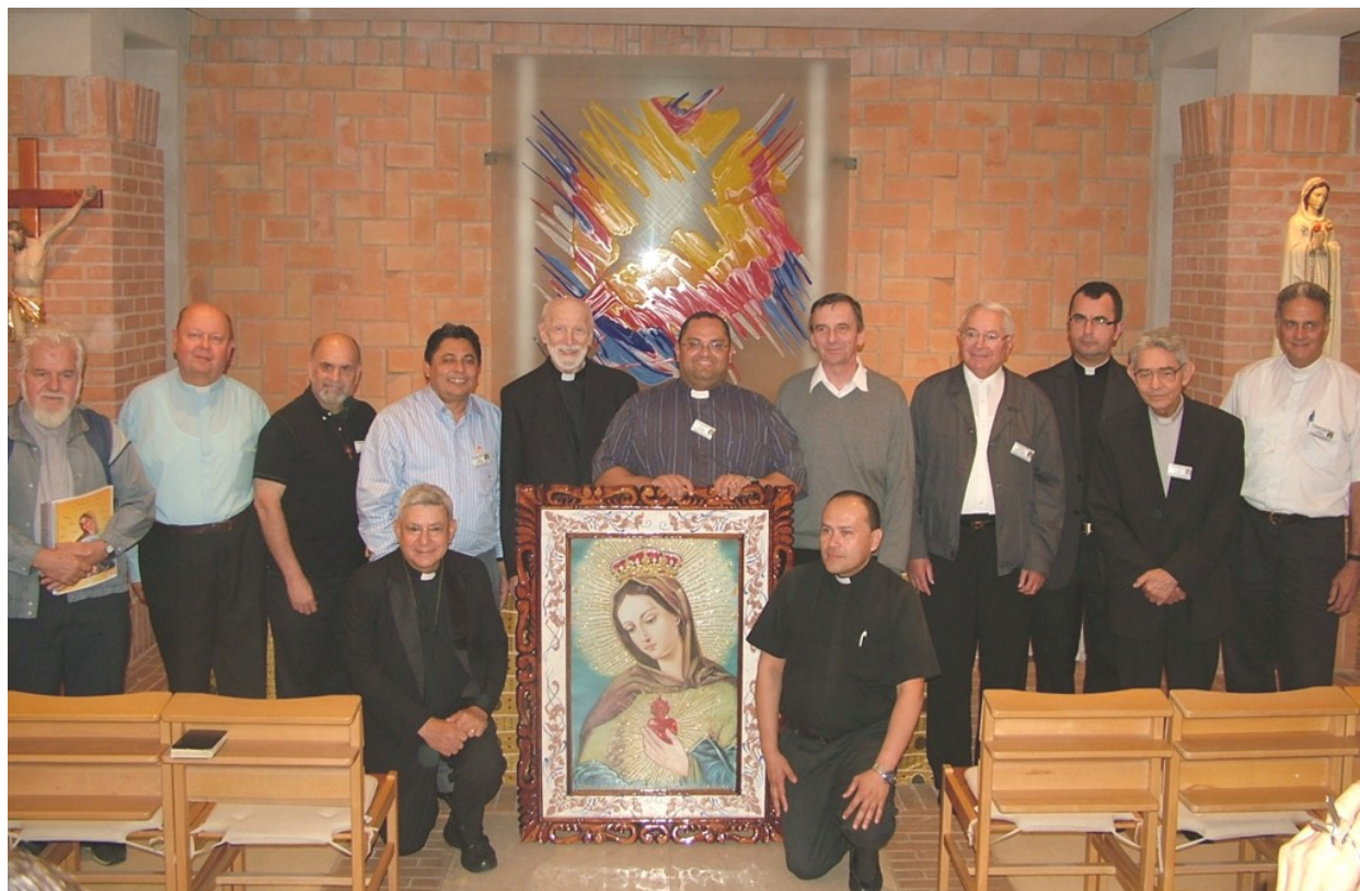
THE PRIESTS ATTENDING THE INTERNATIONAL MEETING