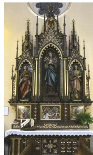
The Altar of Our Lady of the Seven Sorrows , at the Carmel "Do not cry! Go back to the Carmel!", said the friendly and gentle voice of the deceased Carmelite Brother. (July 15, 1961)